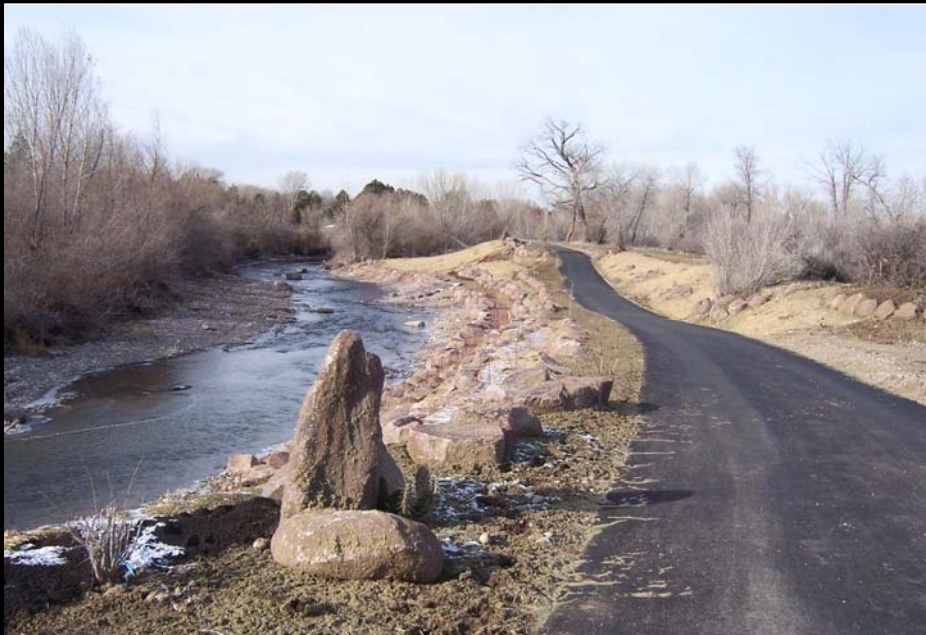
The south section of the Weber River Trail is now re-opened. The trail and riverbank were washed away during the spring runoff in 2011. The riverbank has been stabilized and the trail repaved.