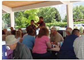
Picnic in the Park

If you haven't been to the Center yet, we invite you to stop by and see what we have to offer.