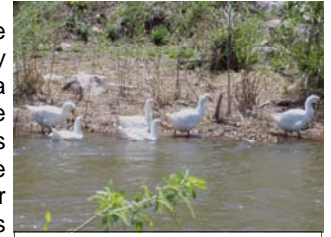
Geese along the parkway trail.

One of the great amenities of Riverdale City is the Weber River Parkway Trail. This is an area shared by people and wildlife alike. Recently there was a beating death of one of the white geese who have made their home along the riverbank. This senseless act of cruelty reminds us that we must keep an eye out for those who choose not to respect the wildlife or fellow citizens. Please report any illegal or suspicious activity to the Police Department immediately. Working together we can preserve the natural beauty and enjoyment of the trail.