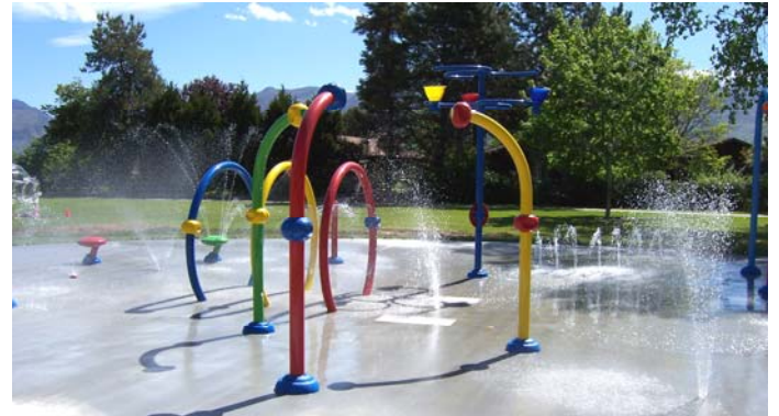
The new splash pad is now open in Riverdale Park.