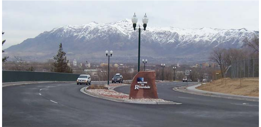
The view on top of 300 West looking north.