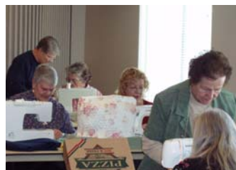
Quilt Block of the Month Club