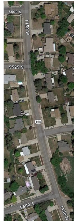
Schedule B: Dipstones on 5500 South, 5525 South, & 5600 South Streets