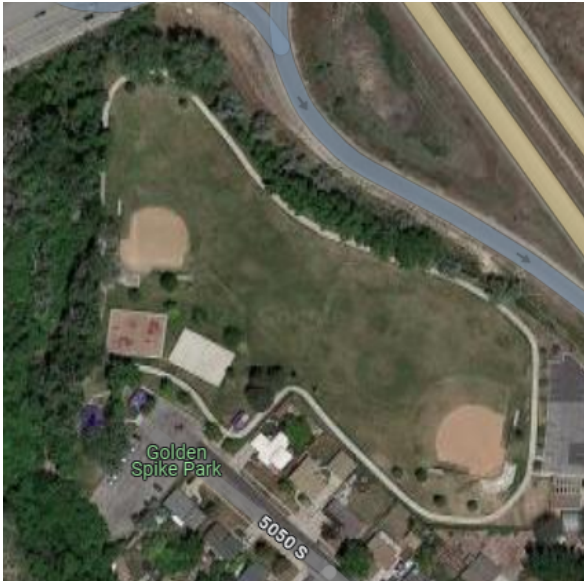
Schedule A: Golden Spike Park Storm Water